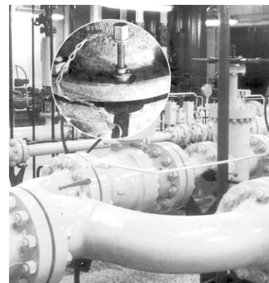
DBP Nr. 2522817 • US Patent No. 4015324