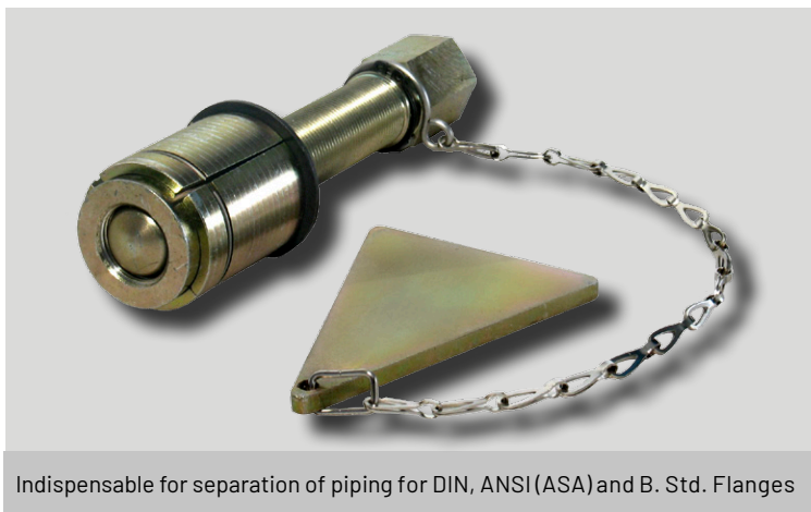
Indispensable for separation of piping for DIN, ANSI (ASA) and B. Std. Flanges